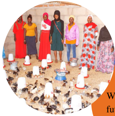
Women for the future Program