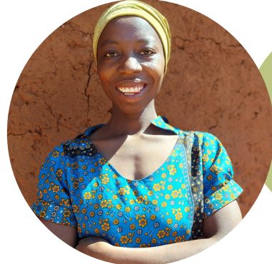
Role model Program